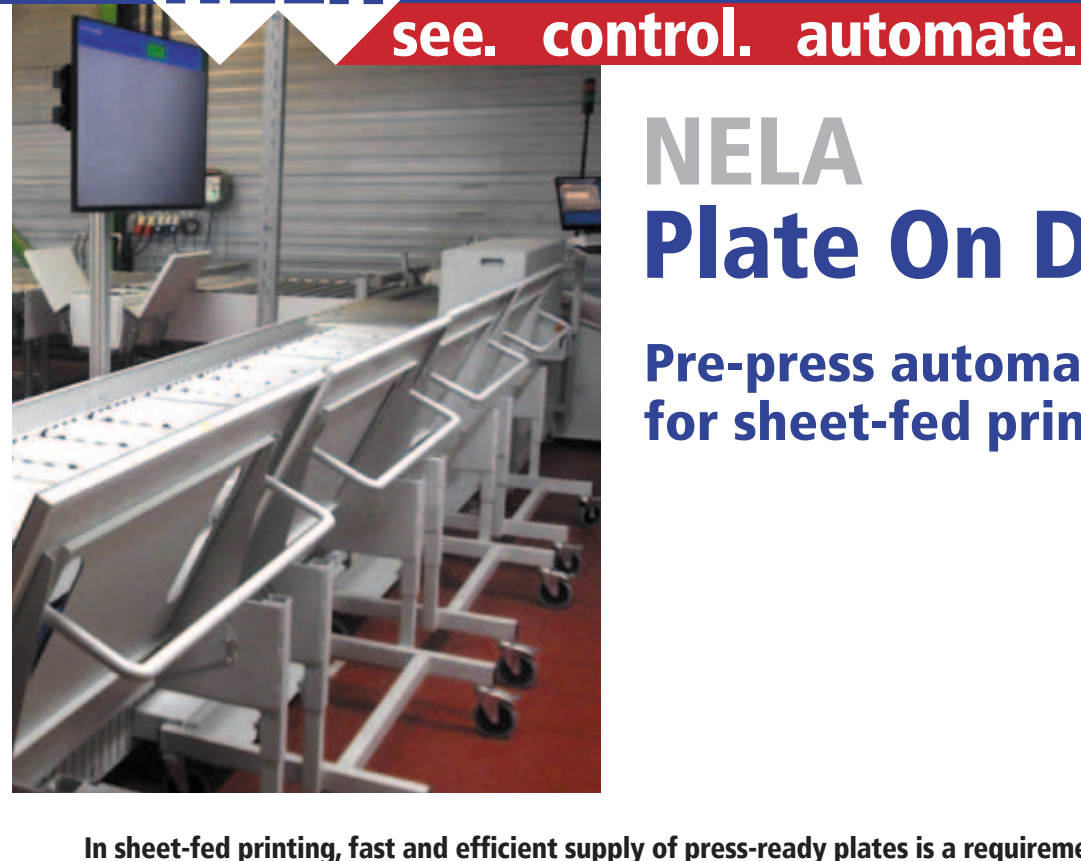
Plate On Demand

As a company with a high degree of vertical integration, NELA bundles all necessary resources to see a project through from start to finish. From the first consultation to the development of hardware and software and the final assembly, at NELA we have everything under one roof. Our global service team supports the customer during installation and all the subsequent years of production. Each department relies on a high technical expertise and is perfectly integrated into the overall planning, production and service processes.